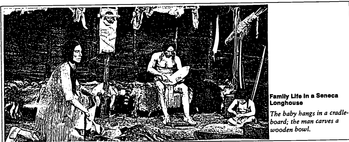
Family Life in a Seneca Longhouse The baby hangs in a cradle-board; the man carves a wooden bowl.

Only two books (Bailey and Boorstin) still use terminology such as “Indian princess”, “Squaw” and “Brave”. Those terms perpetuate the “noble savage” stereotype (“white man’s helpers, beautiful Indian maidens, innocent children of nature, etc.”) 4 The photograph reproduced below illustrates the myth of the “noble savage”. Note that the characters are wax figurines. What also emerges from the picture is the superposition of a European view of a “home” onto another culture. This cultural template is also evident in the text. Boyer writes, for example: “The women cleared, planted, weeded, and harvested the fields of their clan in a leisurely but highly efficient fashion by organizing ‘working bees’, during which they joked, sang, or gossiped their way through each day’s labor” (1990, 103a). “Women joking and gossiping while working” is part of a typical European bucolic and romanticized description of field labor. Note the negative connotation attached to “gossiping.”